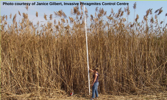
Can grow up to 20 feet tall each summer!