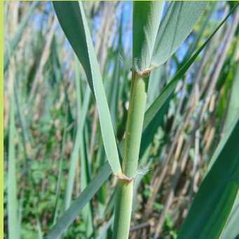
Dull green stems