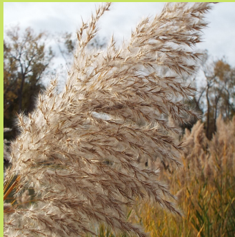
Fluffy tan seed head in fall