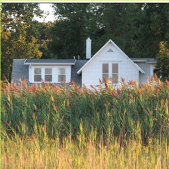
Typically grows in dense patches