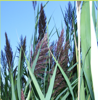
Purplish seed head in summer